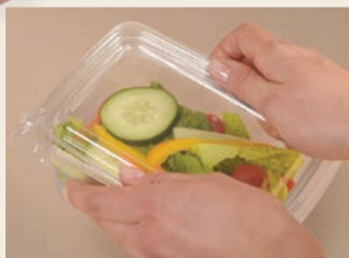
▲ Easy to seal and reuse