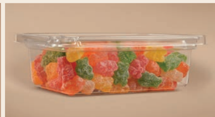
▲ Rib-free design showcases product