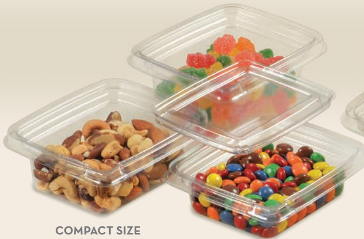
COMPACT SIZE One lid covers 8 oz., 12 oz. and 16 oz.

Optimize storage space and reduce SKU's when you select VersaLock™