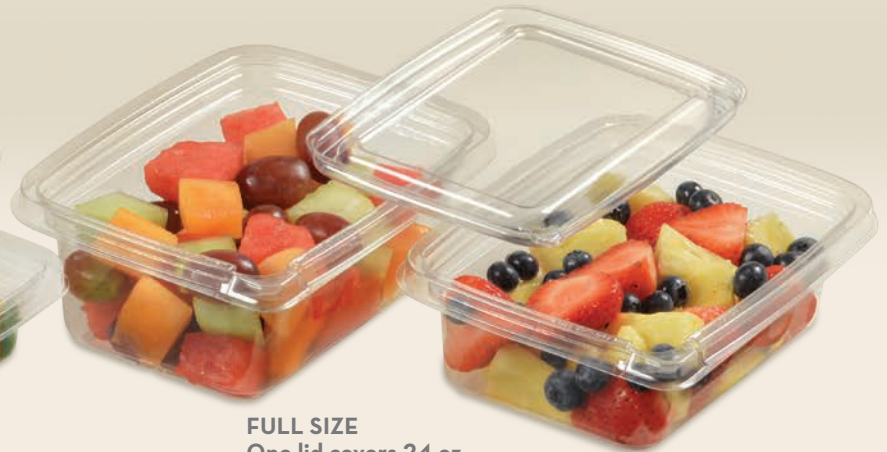
FULL SIZE One lid covers 24 oz. and 32 oz.